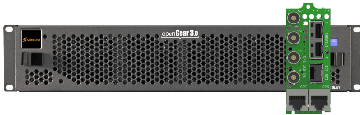
SDI2X Standalone AGSDI2X openGear® card